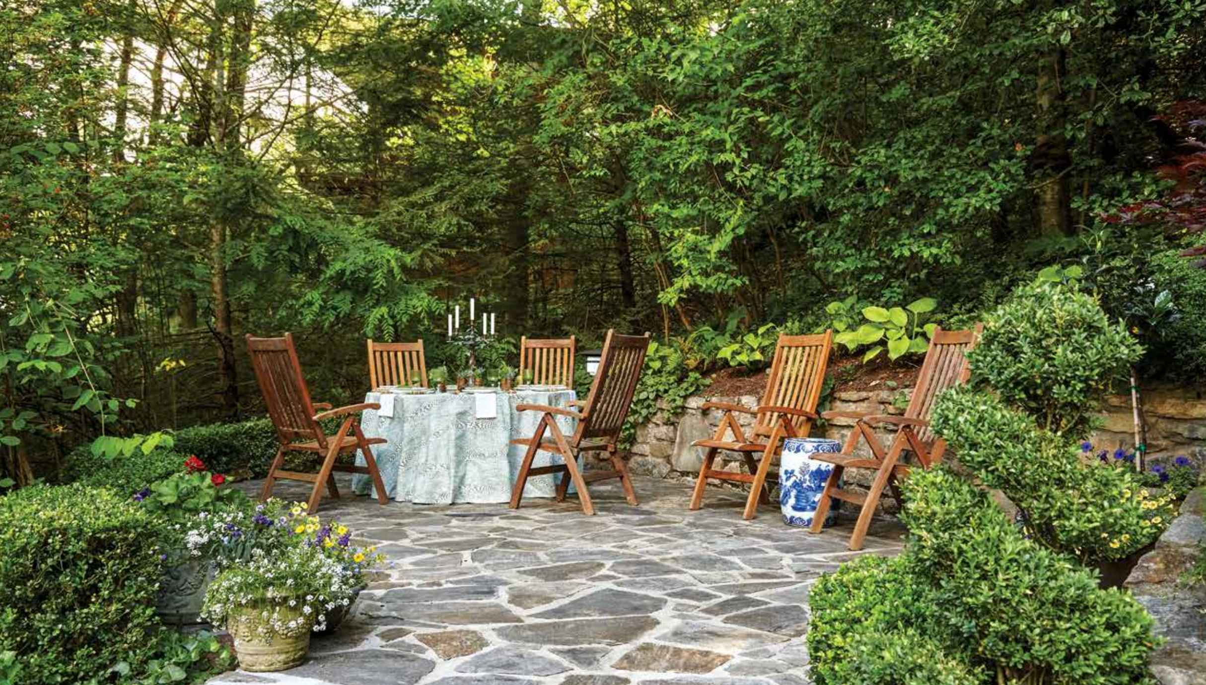
Left and bottom left: Greeley added hardscapes and gravel to help define different areas of the garden. Below: A sitting area with a concrete bench is flanked by spiral boxwoods, larkspur, foxgloves, and Creeping Jenny. Greeley added mirrors in lieu of glass panes in the window, but drywall covers the inside for maximum storage in the newly added master closet.